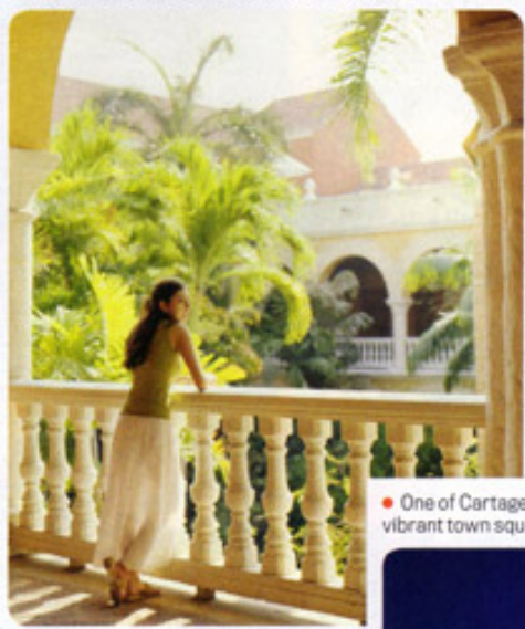
• One of Cartagena's many vibrant town squares.